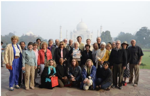
Doctors-on-Tour - India