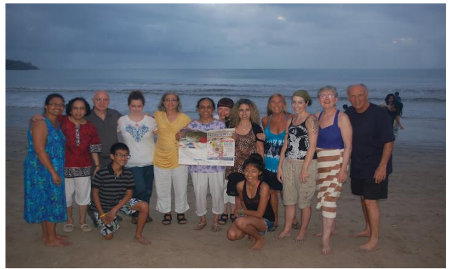
Doctors-on-Tour - Bali