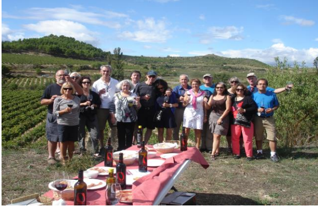
Doctors-on-Tour - Spain